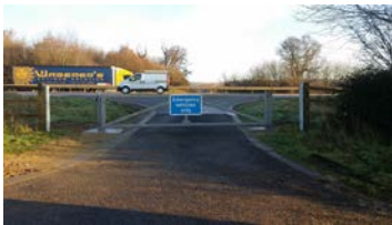
Previous gate & vandalism issue CSG 10405 solution